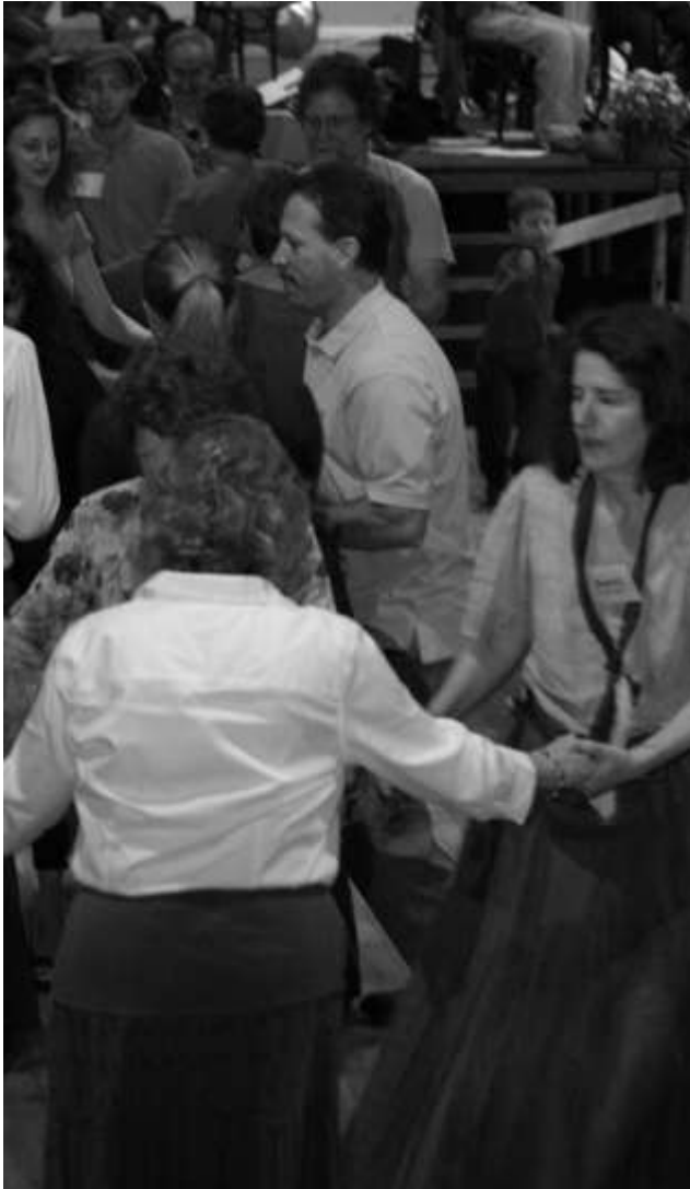
Contra Dancing